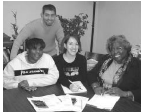
Members of the New Writers' Group offer one another support and encouragement.

With guidance, structure, and motivation, the possibilities are endless. I'll begin with this writers' group, sharing and creating wonderful words." ■